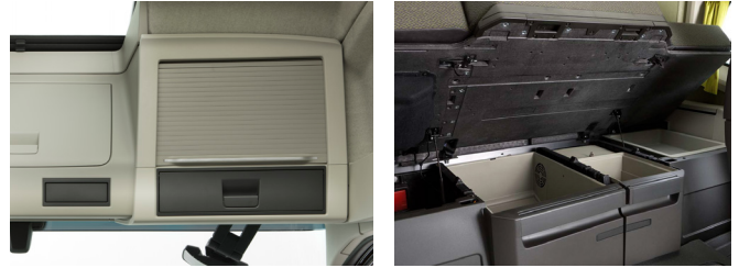
DIN slots and storage units above the windscreen and under-bunk storage units.

The electrical distribution unit is positioned in an easily accessible and protected location in the middle of the instrument panel together with a variety of electrical components and fuses. The truck has a separate electrical distribution unit for body-related equipment, also fitted in the middle of the instrument panel.