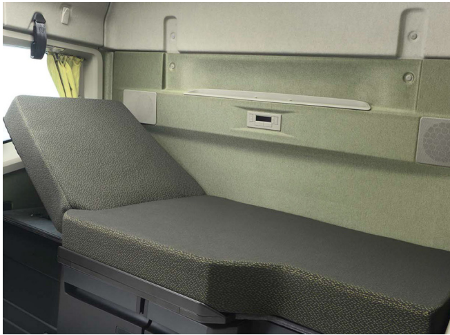
Reclining lower bunk.