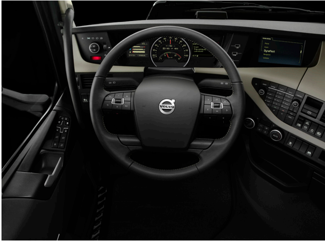
The modern instrument panel offers excellent ergonomics.

Integrated in the front bumper carrier is a very robust Front Under-run Protection System (FUPS) made of aluminium to prevent vehicles from become wedged under the front in the event of a collision. Service points that require the driver's attention are easily accessible behind the front hatch. For easy repair the bumper is divided into three parts and is available in plastic or steel.